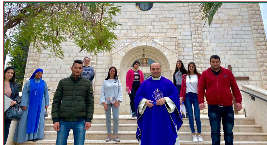
Some of the beneficiaries of the Gaza Job Creation project with the parish priest at the Latin Parish, 2020

The needs in Gaza are enormous and the youths strive to secure the basic needs of life for their children and families. They are seeking employment opportunities to escape the clutches of poverty by all means available. They are enduring exceptional economic, political circumstances and discrimination on the basis of religion that makes them fail to find employment opportunities in the local market. The Latin Patriarchate aims to provide assistance to all of them and give them a chance to gain money in a dignified manner and improve their skills by expanding the program in the near future.