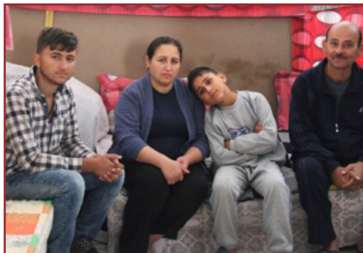
Iraqi Christian Refugee' Family, Jordan 2016

Since their arrival to Jordan in August 2014, Iraqi Christians were living in improvised church premises, halls or caravans. The Latin Patriarchate of Jerusalem has been helping them unconditionally by paying their accommodations, utilities, medical health and transportation costs. The most essential fields of support for the refugees are: first, the educational support – school fees for 1,100 students, transportation for 745 students, book fees for 1,100 students, uniform fees 1100 students, education informal 300 students, life skill trainings for 450 students. Moreover, the LPJ provided around 11,235 displaced Iraqi families with humanitarian support, such as: cash money, food, clothes, shelter, water, medicine, hospital fees, transportation, etc.