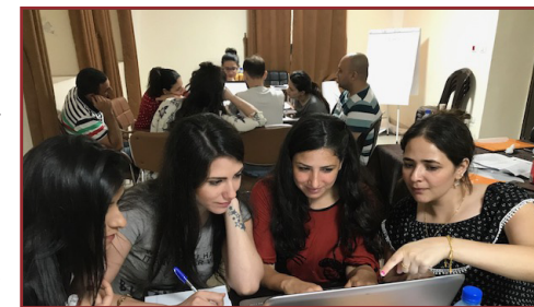
Capacity Building for the Beneficiaries of Gaza Job Creation Project, January 2020

Gaza for a specific period of time ranging from 12 to 27 months depending on funding available and contributions from the hiring institutions. The candidates were chosen after a call for applications that was launched through the Churches and the Holy Family Church's networks in Gaza focusing on the capabilities and qualifications of the youth themselves and work on providing job opportunities that matches their skills and future aspirations. This opportunity has helped the youth to gain work experiences and life skills, which will allow them to stand out to future potential employers when the program ends. Through the project, the youth received life skills training and general capacity building workshops on the jobs they are performing.